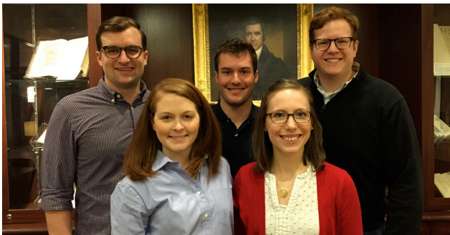
Members of the Volume 56 Executive Board