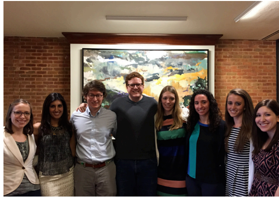
The Volume 56 Articles Committee